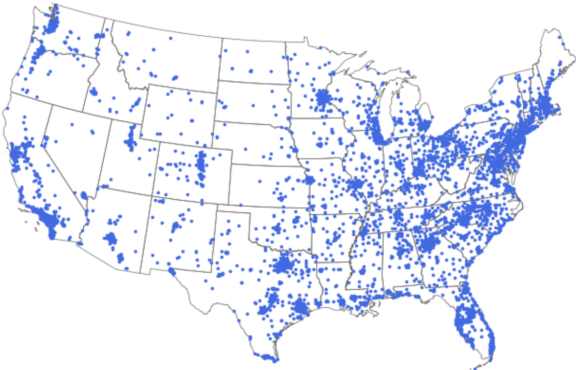
Pictured: Distribution of Domino's Restaurant Locations

We propose trials in two states. First would be Coinsource's home state of Texas, which is responsible for nearly 7% of pizza industry revenue. Second is California, accounting for over 9% of total national pizza sales.